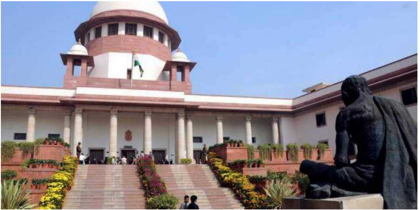
Supreme Court of India (File Photo)